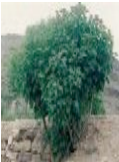
BAIPL Non Grading Plant