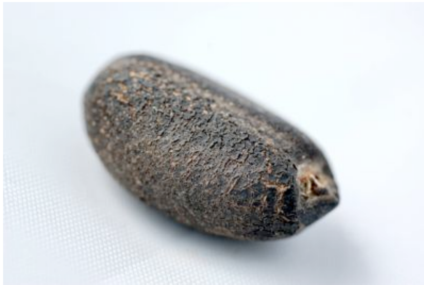
BAIPL Grade A