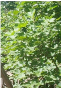
BAIPL Grade A Plant